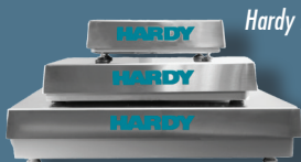
Hardy Bench Scales